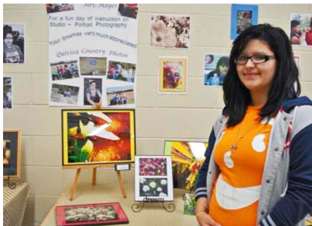
Opportunity Now students will display their photography thanks to a new SEF grant.