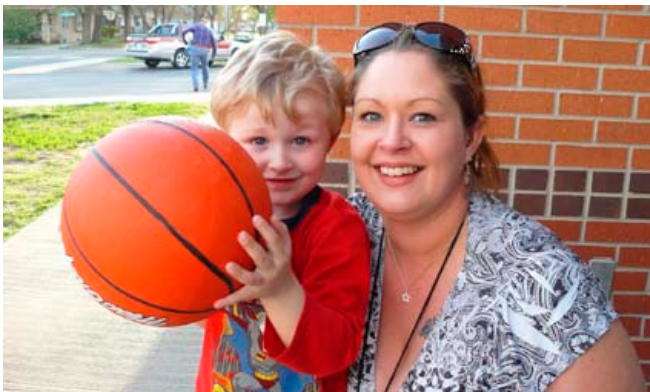
Cottonwood Preschool children loved the ball they received through an SEF grant funded by the Salina Regional Health Foundation.

YES! I want the BEST for all students in the Salina School District! Gifts are tax deductible to the extent allowed by law.