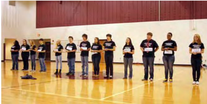
South High theatre students present "Weight of Words" to Lakewood students.