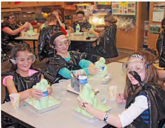
Heusner Science Geeks.

Gary will utilize a high-speed digital camera that is capable of capturing motion at 120 frames per second. Physics students will be able to analyze motion and plot points during motion which can then be used to calculate velocity, acceleration, and forces acting on the object in motion.