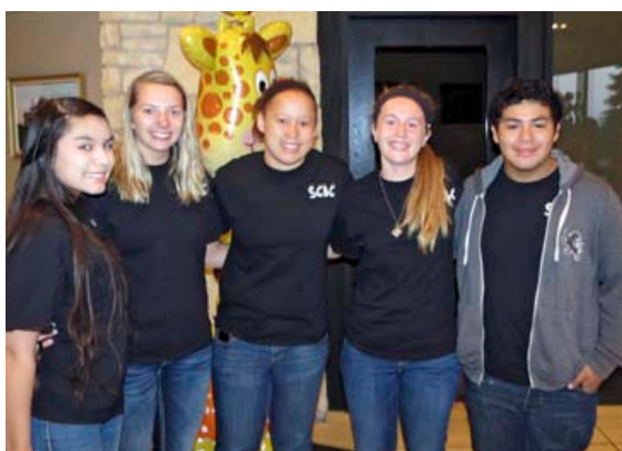
Central High students

The Central High Book Club is a diverse group of students who meet monthly to discuss books that they have read. Students shared a book promo that they created and spoke about the process of selecting the book the group would read each month. While every student has a preference for a particular genre, they all are open to the monthly selection and agree that reading different books gives them insights that they otherwise might not have.