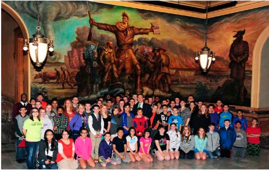
Lakewood students with Governor Brownback

a grant to take all Lakewood 7 th graders to Topeka to visit the State Capitol, the Brown vs. Board of Education Historical Site, and the Ritchie House (Underground Railroad). Students observe, learn, and remember more information because of their trip to these three historical sites. One student even observed that Governor Brownback wore a lime green tie!